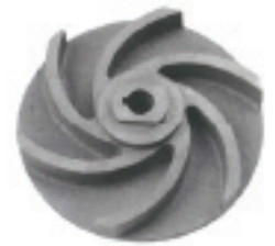
Cast Iron Impeller Components