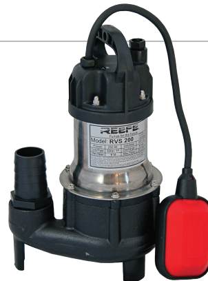
REEFE Submersible Pump (RVS200)